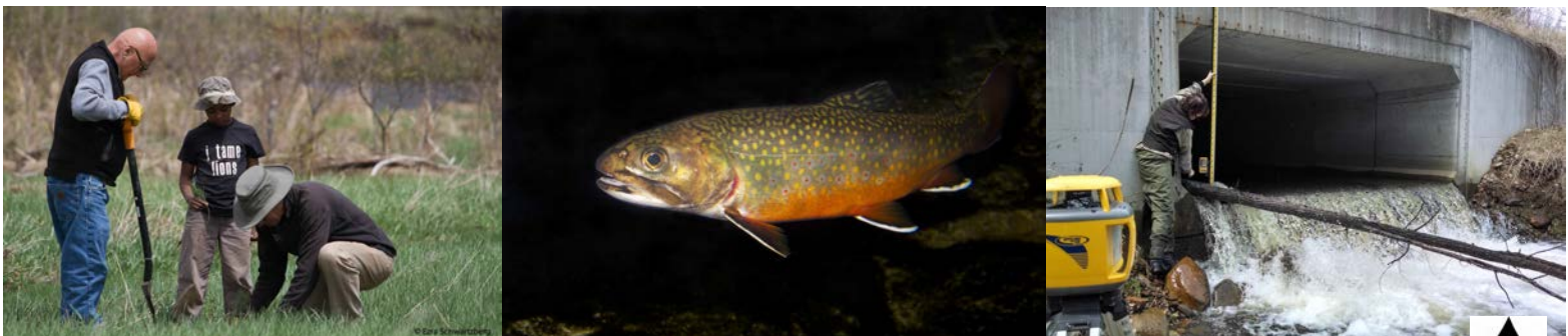
L to R: Riparian planting, Brook Trout, Data collection on Palmer Brook